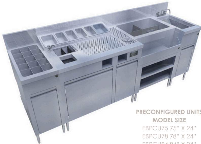
PRECONFIGURED UNITS MODEL SIZE

EBPCU75 75" X 24" EBPCU78 78" X 24" EBPCU84 84" X 24"