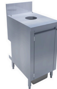
TRASH BIN MODEL SIZE

EBDB12 12" X 24" EBDB15 15" X 24" EBDB18 18" X 24" EBDB24 24" X 24"