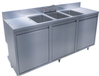
3-COMP SINK MODEL SIZE

EBPCU75 75" X 24" EBPCU78 78" X 24" EBPCU84 84" X 24"