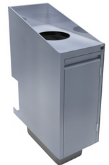
TRASH UNIT FOR SLIM JIM MODEL SIZE