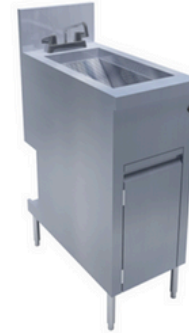
DUMP SINK MODEL SIZE

EBIBW12 12" X 24" EBIBW15 15" X 24" EBIBW18 18" X 24" EBIBW24 24" X 24"