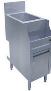
BOTTLE WELL MODEL SIZE

EBIB12 12" X 24" EBIB15 15" X 24" EBIB18 18" X 24" EBIB24 24" X 24"