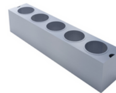
BOTTLE HOLDER FOR CONDIMENT TRAY