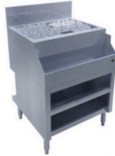
ICE BIN MODEL SIZE

EBIB12 12" X 24" EBIB15 15" X 24" EBIB18 18" X 24" EBIB24 24" X 24"