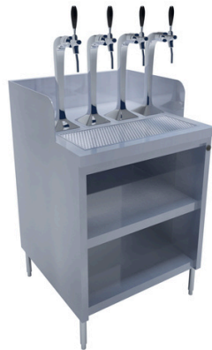
DRAFT TOWER UNIT 24"