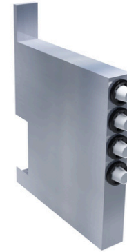
CUP DISPENSOR HOLDS 2, 3 OR 4 CUPS