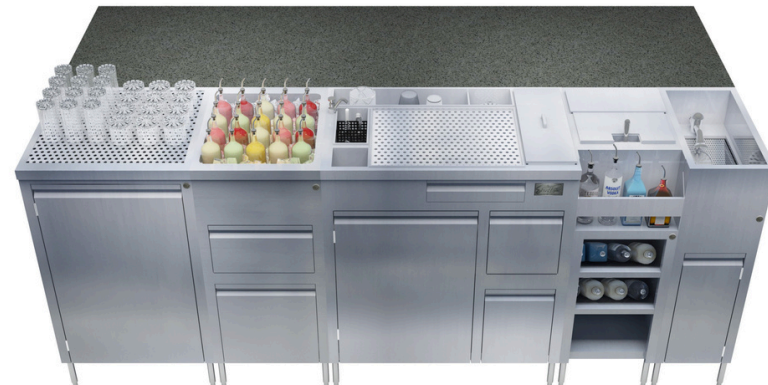
EuroBar | Alto ™