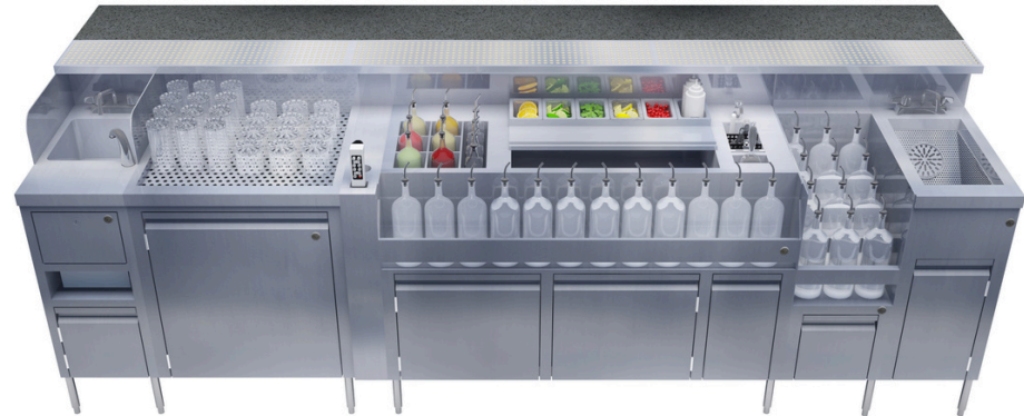
EuroBar | Sportivo ™