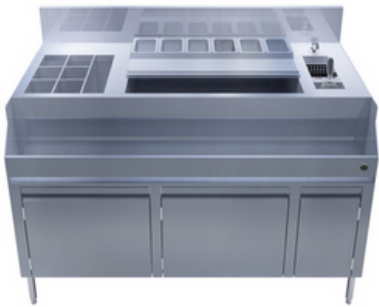
EUROBAR SPORTIVO™ MAIN STATION MODEL: EBMSP48