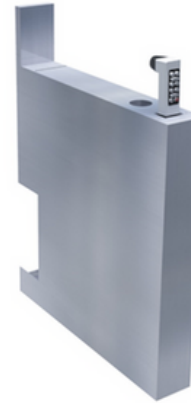
RETRACTABLE SODA GUN MODEL EBSGF4R (PATENT PENDING)