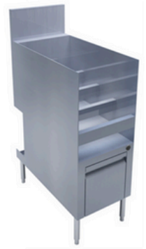
LIQUOR TREE MODEL SIZE

EBDSBS12 12" X 24" EBDSBS15 15" X 24" EBDSBS18 18" X 24" EBDSBS24 24" X 24"