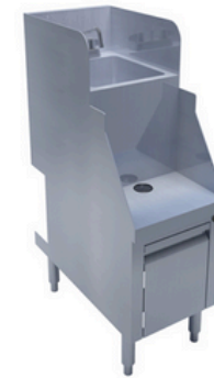
BLENDER STATION MODEL SIZE

EBDSBS12 12" X 24" EBDSBS15 15" X 24" EBDSBS18 18" X 24" EBDSBS24 24" X 24"