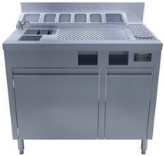
EUROBAR CLASSICO™ MAIN STATION MODEL: EBMWS36