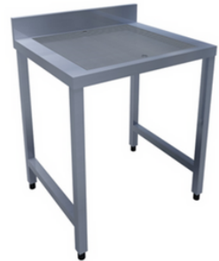
DRAINBOARD TOP MODEL SIZE EBDBT28 28" X 24"