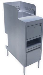
HAND SINK MODEL SIZE

EBFSU12 12" X 24" EBFSU15 15" X 24" EBFSU18 18" X 24" EBFSU24 24" X 24"