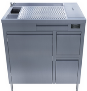
EUROBAR ALTO™ MAIN STATION MODEL: EBMSA36