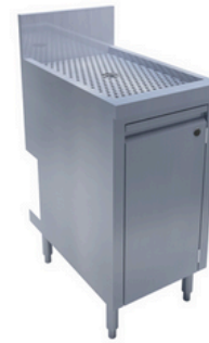
DRAIN BOARD MODEL SIZE

EBDB12 12" X 24" EBDB15 15" X 24" EBDB18 18" X 24" EBDB24 24" X 24"