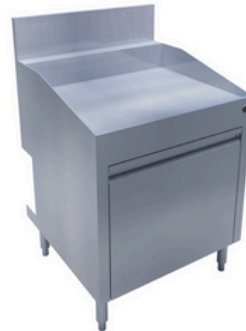
FREE SPACE MODEL SIZE

EBULD12 12" X 24" EBULD15 15" X 24" EBULD18 18" X 24" EBULD24 24" X 24"