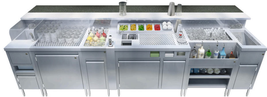
EuroBar | Classico ™